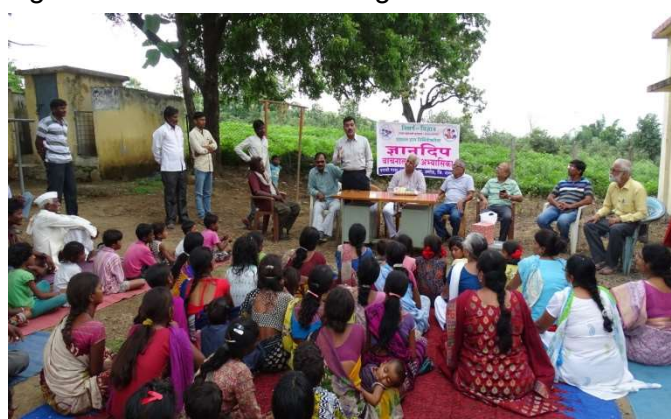
( Orientation class for Warali paintings at Khadakpada, Mumbai & Paradhi pada at Dahegao Nagpur)