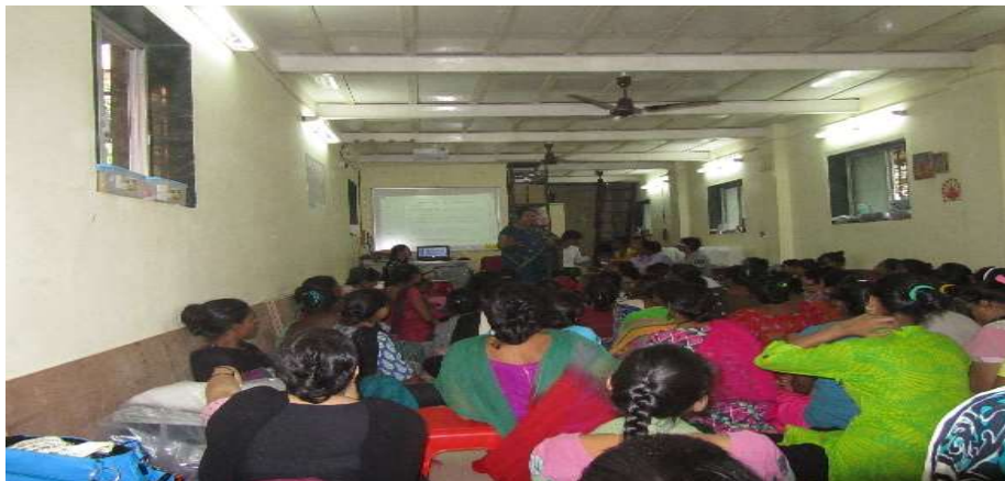
( Women participated in awareness session of their health & hygiene )

Session on Cholera was taken by the social worker on 10th July 2017 for the women from the Pardeshi community. The reasons, symptoms, treatment and precautions were explained during the session.