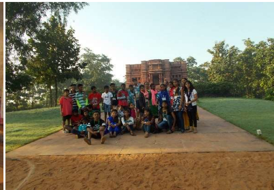
( Residential camp of students to inculcate culture of sportsmanship amongst students )