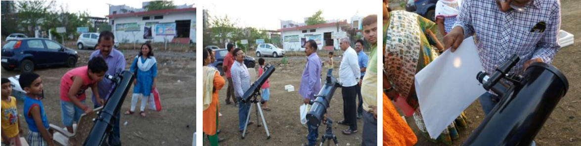
( Demonstration and observation of images of sun on the event of solar eclipse )

To create interest about universe and planets amongst students and science lover people. Sky watching and day time astronomy study, observation of planets through high resolution telescope organized at School of concepts, Besa, Nagpur and some selected schools under project vicinity at Nagpur and Mumbai.