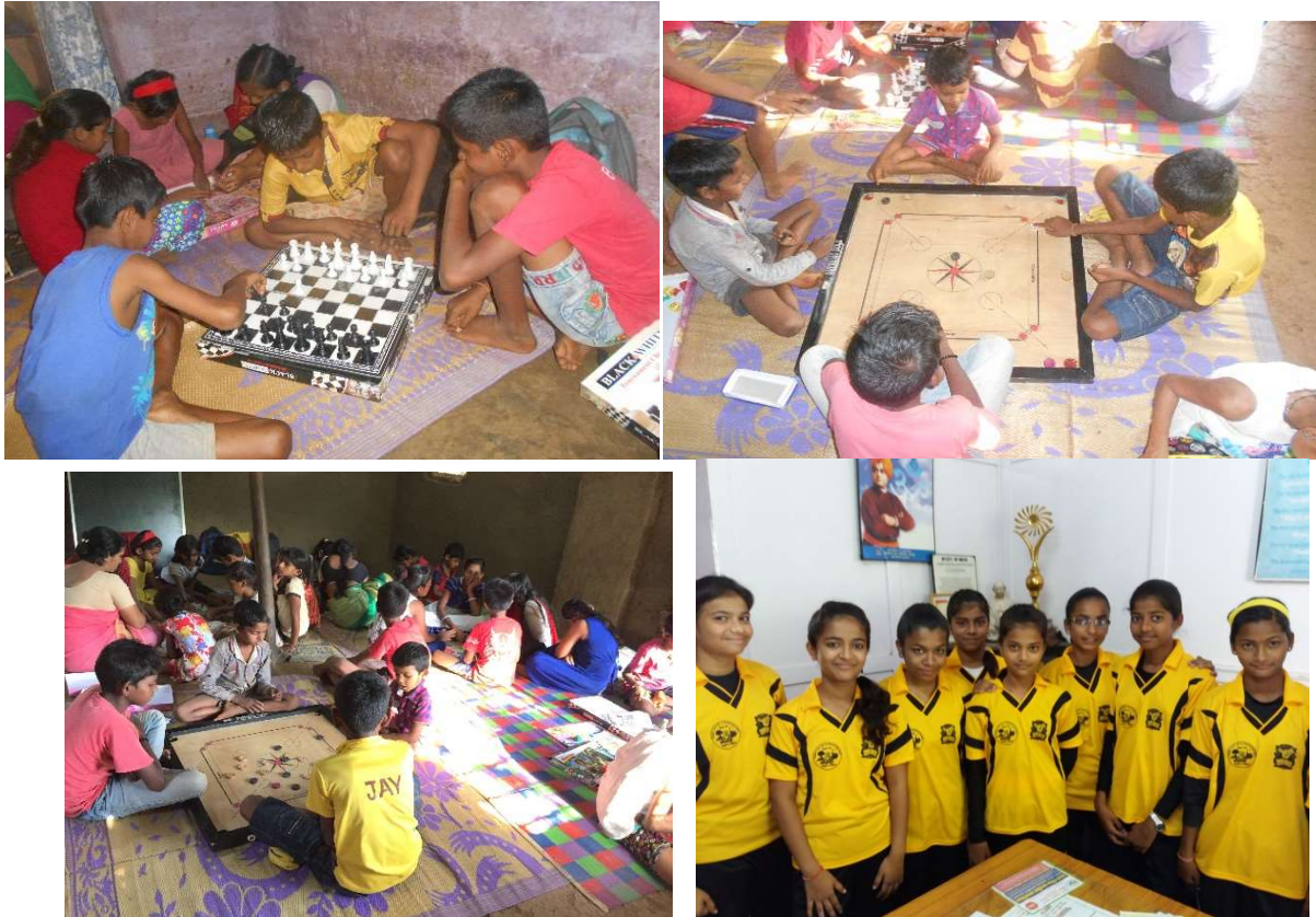
( Team of game chess at Mumbai and Volleyball at Nagpur supported by NiViM)