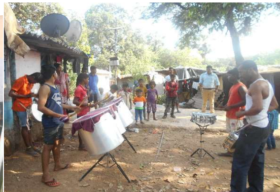
( Lezim and drum training given to tribal students to organize awareness and action)