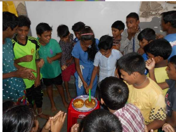
( Celebration of Birth Day of tribal students at Community Resource Centre (CRC), Mumbai )