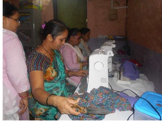
( Tailoring class for women to cover livelihood security of project area women)