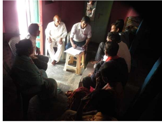
(Meeting with Community leaders at Khadakpada Mumbai and Paradhipada, Dahegaon , Nagpur)