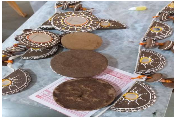
( skill development training to project area women at Nagpur & Mumbai)