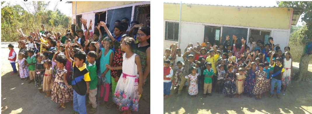
( The best, new cloths and uniforms distributed to students in project area at Mumbai )

Sixty-one children were given new costly dresses of their age on 22nd February, 2017. They were extremely happy. For many children it was the first time they were wearing so costly dresses.