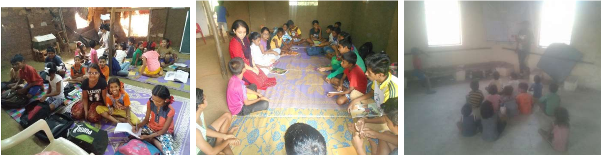
(Study supporting classes at Khadkpada, Mumbai and Paradhpada, Dahegaon, Nagpur)

Study classes for total 61 children from 11 different schools were organized at tribal community. Eight students (5 girls and 3 boys) were going to colleges for higher education. Exam Preparation were done in the month of March, 2018 by conducting extra classes and giving individual attention each student.