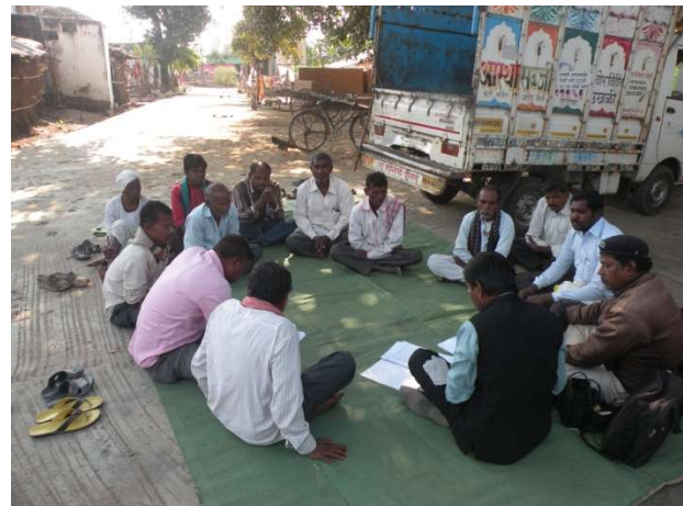
( Meetings, exhibition and Workshop for rural stakeholders and forest dwellers )