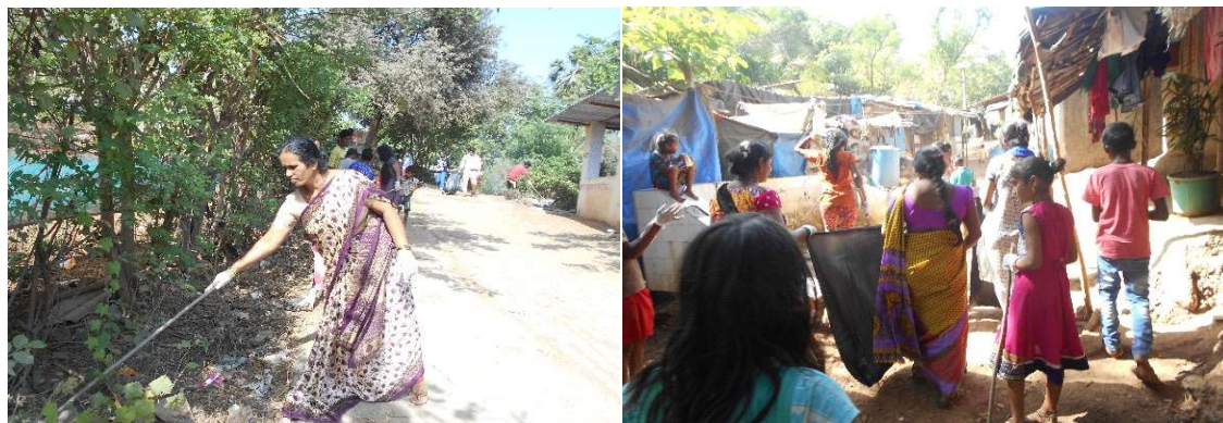
( Children, Women and community leader engaged in cleanliness campaign )