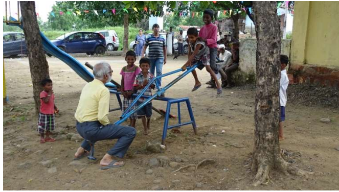
( Students of Mumbai enjoying a see-saw game and children of paradhi pada , Nagpur during out door picnic cum education excursion trip camp )