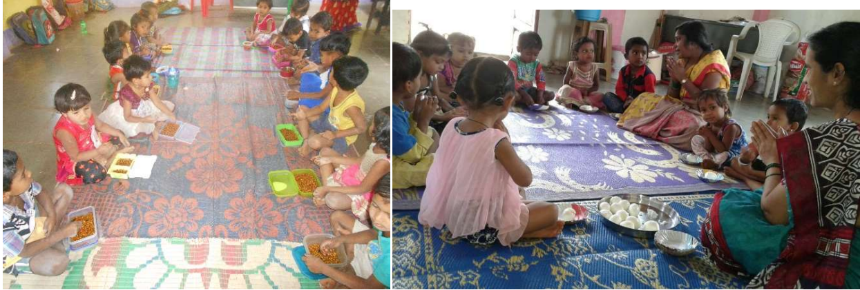
( Distribution of nutritious break fast regularly to children of both community)